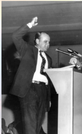
William Marrion Branham

And, remember, I say this as God's prophet, the Russian empire will drop an atomic bomb of some sort on the Vatican City and destroy it in one hour. THUS SAITH THE LORD.